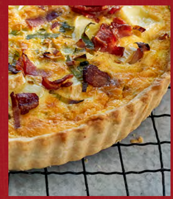
Baked Ham, Caramelised Leek & Cheddar Quiche