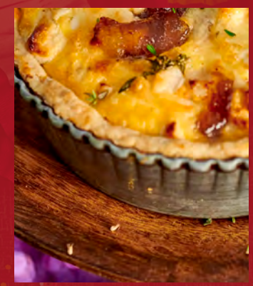
Three Cheese, Onion Marmalade & Thyme

With spinach, pine nuts and herbs |1.95kg| Serves 12+