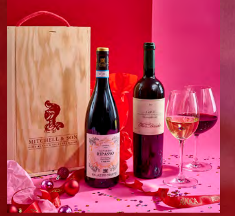
ITALIAN INSPIRATION €60.00

Domaine Garnier Chablis & Domaine De La Madone Fleurie